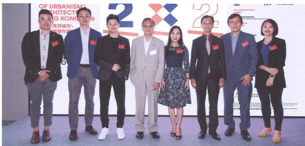
ABOVE Curators and organisers at the preview of UABB BELOW RIGHT The Pulse interactive installation